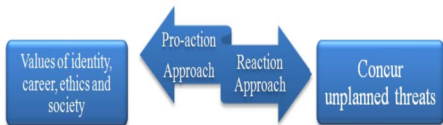
Fig. 2. Two alternative approaches for problem solving.

In real world, none of us is Indiana Jones, and nor do we have the facilities to cling to when in danger. Thus, one cannot avoid making smart proactive plans to defend values of identity, career, ethics, and society (Fig. 2).