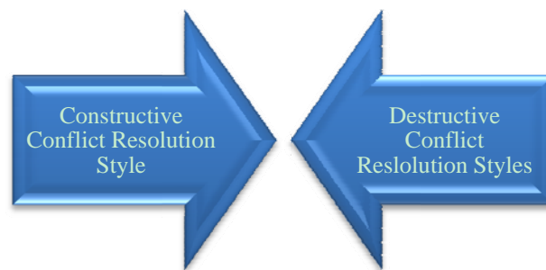
Fig. 3. Two styles of conflict resolution.

The researches show that both of husband and wife conflicts make significant negative effects on permanent life relationship. However, conflict resolution should be assumed as important criteria to evaluate the success of a marriage.