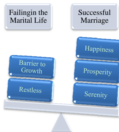
Fig. 1. Signs of successful and failed marriage.

psychologists define it as: "satisfaction from the existing conditions." A philosopher once said: "you live as you think."