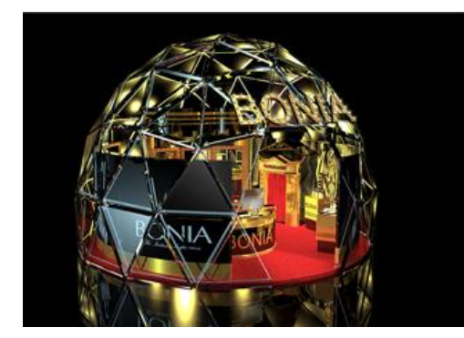
Fig. 4. Exhibition booth output (Bonia).