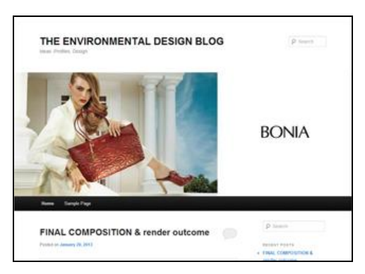
Fig. 3. Students blog 1 - Brand (Bonia).

feedback from the survey (See Fig. 3 and Fig. 4).