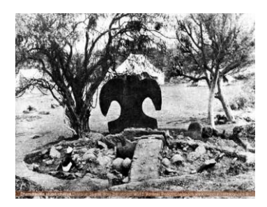
Fig. 8. 1st anthropomorphic figurine, Mottur, Tiruvannamalai district.

circle. It was probably a primitive form of idol worship, paving the way for constructing structural monuments of bricks and stones. The presence of both cairn circle and anthropomorphic figure at one place shows the gradual and steady development in constructional activities and changes in cultural status.