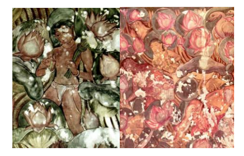
Fig. 11. Sitthannavasal paintings.

Kodumanal (Kodumanam in Sangam literature) situated in Erode district has yielded vast materials on the various dimensions of ancient Tamil society. The materials are of various types like cairn circle with cist, urn, transcepted cist