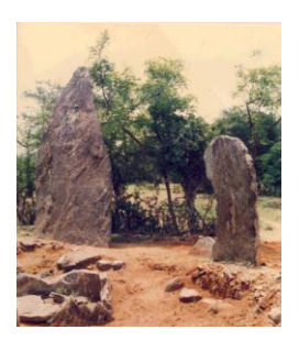
Fig. 13. Menhir, Kodumanal