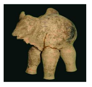
Fig. 5. Bull shaped sarcophagus, Andipatti, Tiruvannamalai district, northwestern Tamilnadu.