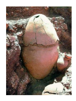
Fig. 6. Urn burial Adhichanallur.

Some of the excavated places are Adhichanallur, Sanur, Mottur, Sitthannavasal, Kodumanal, Andipatti, Perumbair, Amirthamangalam and Korkai [12]-[20]. Adhichanallur yielded numerous number of Urn burials (Fig. 6) with varied megalithic assemblages like iron implements, gold objects, different types of potteries like black and red ware, black and red ware urn (Fig. 7), graffiti marks, skeletal remains and various other related materials. More than 100 acres of land at Adhichanallur are covered by burial monuments. Numerous urns have also been unearthed.