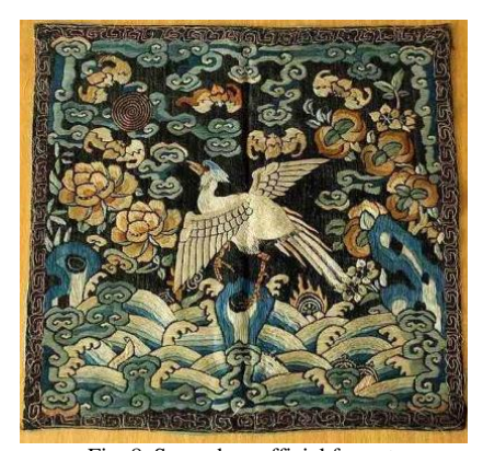
Fig. 8. Secondary official format. (https://kknews.cc/history/l24yon9.html)