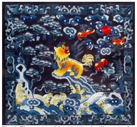
Fig. 9. The pattern of the third-level military attache. (https://kknews.cc/zh-sg/history/28ebvxy.html)