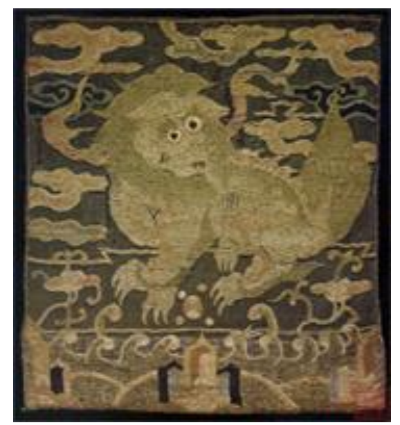
Fig. 5. The pattern of the first-level and second-level military attachés. (https://kknews.cc/zh-tw/history/5lk8nll.html)