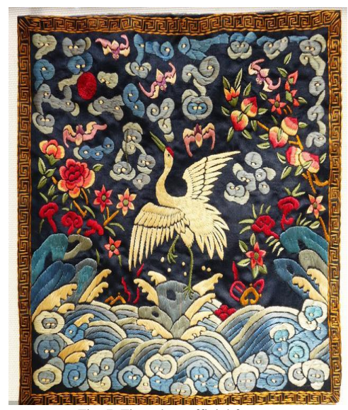
Fig. 7. First-class official format.