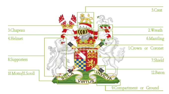
Fig. 1. Composition of European heraldry chapters and extension of issues.

Coat of arms is one of the traditional western art forms, which are inherited, displayed and awarded through the study of heraldic symbols [1]. Coat of arms are color signs formed according to specific rules and are unique to an individual, family or group. It consists of two parts: pattern and color [2]. Coat of arms originated in Europe in the 12th century. At the time, kings and samurai added striking colors or coats of arms to the exterior of shields, guns and cannons for identification on the battlefield or arena [3]. Fig. 1 below shows the European emblem pattern. This time, the emblem pattern of the British royal family is used as an example. More broadly, the observation of logic and graphic symbolism expressed in heraldic design can also help us to understand more about the characteristics and thinking direction of Western culture [4].