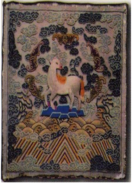
Fig. 6. The pattern of the ninth-level military attache.