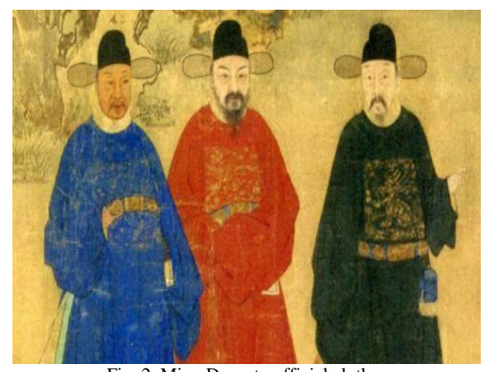
Fig. 2. Ming Dynasty official clothes

Mandarin square is a kind of official uniform of Ming and Qing dynasties. The common ones are round-neck robes, with patches on the front and back, belts (divided into horn belts, jade belts, etc. according to grade), and a few have cross-collars [9]. At first, the official uniform did not have any special name, it was just called the official uniform. It was not called the Mandarin square until the Qing Dynasty, and it is still in use today [10]. In the Ming Dynasty, round-neck robes or cross-neck robes embellished with supplements were used as official uniforms. At that time, this kind of clothes was not called Mandarin square. The chest and back of official uniforms are decorated with patterns, civil officials have bird patterns, and military officers have animal patterns. As shown below Fig. 2.