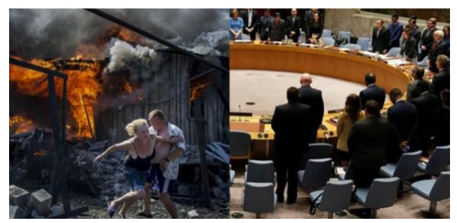
Fig. 1. Comparison of meeting record and war photography.

So, how to improve the news photography aesthetic? For news photographers, aesthetic appreciation is mainly reflected in visual effects, emotional expression and information value. First of all, visual effects mainly rely on the photographer's photographic awareness and photography techniques. The awareness of 1 photography shows that the photographer has a sense of the news, looks for interesting points of time and looks for interesting angles. In some regular reports, such as press conferences and speeches, the main characters are all the guests on the stage. Many reporters shoot on the stage, and the effect is almost the same. However, for some sudden events, such as explosions, car accidents and parades, photographers with photographic consciousness usually pay attention to the moment, which is the best representative of the news event, and the richest in character features and the most capable of displaying the emotional color of the parties involved. As shown in figure 1, the right picture, the meeting scene, only has the function of record. In the left picture, civilian homes in Luhanskaya village were destroyed in the air raid, which shows that the war brought great suffering to people. This kind of documentary photography can not only arouse the public's condemnation of the war but also express people's good wishes for peace.