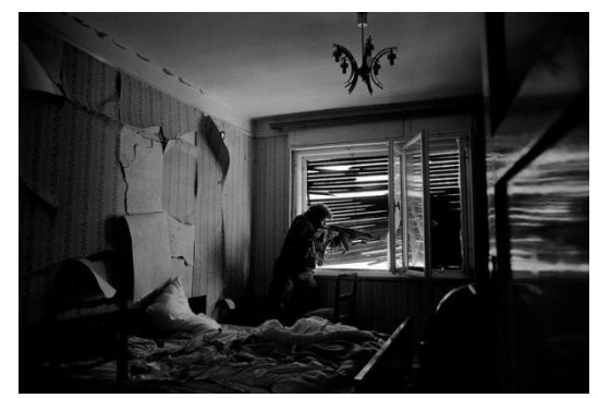
Fig. 9. Soldiers in the Chechen conflict. (Source: https://expertphotography.com/war-photographers/).

The images exposed the brutality and contempt for human rights of Australian special forces, directly forming evidence of war crimes committed by Australian troops.