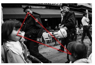
Fig. 4. Triangle rule in photography.

We will see the rule of the triangle as shown in figure 4. Geometric symbols help to control the flow of the picture, make the subject in the picture have a sense of communication, and cleverly connect the elements in the picture. The triangle rule is mostly used in portraits of people, where the most important elements are placed in the center [4]. Since people are an important factor in news events, the triangle rule is widely used in news photography.