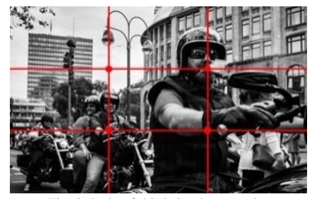
Fig. 2. Rule of thirds in photography.