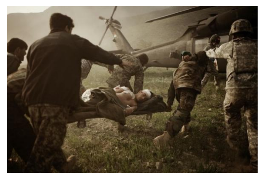
Fig. 14. Successful rescue.

as "If it bleeds, it leads". The recording of photographs seems to be connected with photojournalism. Susan Sontag once wrote that photography has been associated with death ever since the invention of the camera in 1839. Initially, photography was used as a propaganda tool to support the war, but since the beginning of World War I, photography has had the opposite effect. Images of the tragic faces and mutilated limbs of dead or dying soldiers shrouded in hunger, injury, cold and death in the harsh conditions of combat found their way into newspapers and popular print media (Fig. 14). Thus arose the tension between the desire to win the war and the end of war and suffering. In the early days after the invention of the camera, efficient photographers replaced sketch artists on the battlefield, vividly documenting soldiers' heroic victories and heroic sacrifices [19].