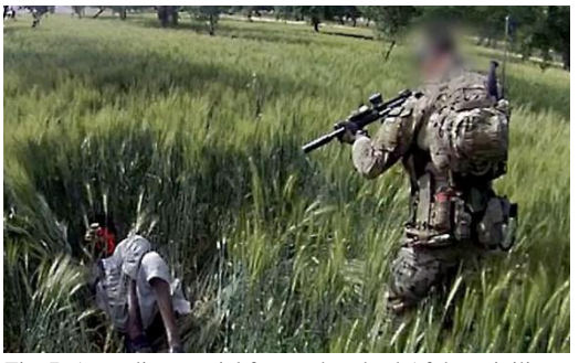
Fig. 7. Australian special forces shot dead Afghan civilians.

condemnation around the world. The Brereton War Crimes Report says 19 soldiers from Australia's special air defense forces beat and killed at least 39 Afghan civilians, including children. Over the past four years, the team has interviewed 423 witnesses and received more than 20,000 documents and 25,000 images [12]. Reports and evidence show that soldiers carried out a number of gruesome acts including slitting throats, killing counts, having cows stomp on civilians, and drug and alcohol abuse (Fig. 7 and Fig. 8) [13].