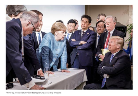
Fig. 6. German Chancellor Angela Merkel gazes at U.S. President Donald Trump at the G7 summit.

As shown in Fig. 6, German Chancellor Angela Merkel had a dispute with US President Donald Trump at the G7 summit. Trump repeatedly demanded that Germany owes a large amount of money to the US. Merkel had to explain to Trump the basis of trade with the EU, and Merkel showed no weakness in the face of Trump. Photojournalist Jesco Denzel documented the game between nations on international occasions.