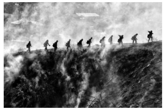
Fig. 10. The soldiers who ended the battle.

Nick Ut is a Vietnamese-American photographer who worked for the Associated Press in Los Angeles and won the 1973 World News Photo of the Year for "The Horrors of War." The scene in the picture is that some children ran away from napalm during the Vietnam War (Fig. 10) [14]. Nick's works directly expose the nature of war -- death or imminent death, which has a strong realistic documentary style.