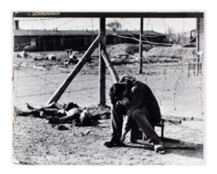
Fig. 12. Grieving beside a scorched friend. (Source: https://www.icp.org/browse/archive/objects/man-griefing-next-to-thecharred-body-of-his-friend-germany).

Gandhi, Selassie, Churchill, Pope Pius XII, and Stalin[15]. "In 1941, as the Only Western photographer, she witnessed the German invasion of Moscow. She was the first woman to accompany an American Air Corps on a bombing mission in 1942. And she traveled with Patton's troops across Germany in 1945 to liberate several concentration camps "[16]. Like other photographers, she was constant in danger in the war. From the Atlantic to North Africa, her ship was torpedoed, but she survived, and her most famous works include the concentration camp prisoners and the bodies of the gas. (Fig. 12).