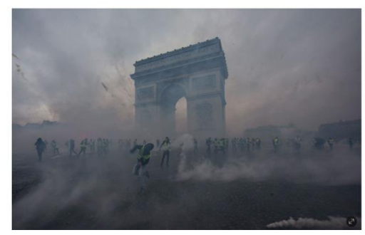
Fig. 5. Protesters clash with police at the Arc de Triomphe in Paris.

these factors, it resonates instantly. Protesters clash with riot police in front of the Arc de Triomphe in Paris on November 17, 2018. Demonstrators in yellow vests take to the streets to protest against the 2019 fuel tax. The protests eventually turned into rioters, despite French President Emmanuel Macron's announcement of tax cuts from the budget, but the unrest continues. Photojournalist Veroniquede Viguerie captures the hectic scene [5]. In this photo (figure 5), the atmosphere of smog is like war. France's worst riots in 50 years have devastated the French economy. On Dec. 20, the Museum of Versailles announced that it would close for a day on Dec. 22 because of the protests. The scale of the rioting at the Arc de Triomphe, a French landmark and tourist attraction, was a reminder of the tensions between the people and the government as well as regional unrest.