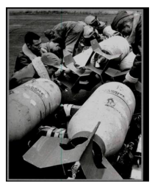
Fig. 13. Install B-17 bombs destined for targets of Europe (Source: When Maggie flew with the forts: Margaret Bourke-White risked all to capture U.S. air operations over Europe in World War II).

Margaret Bourke-White, a war photojournalist who often worked in dangerous environments and captured images in combat many times, was eager to report on the operations of the U.S. Eighth Air Force in 1942. At the same time, she was already in danger of covering the German bombing of Moscow in 1941. Fighting and working on the ground and in the air has become routine for her [20]. In Fig. 13, Margaret captures armored troops installing a 500-pound An-M64 general bomb for use on targets in Europe.