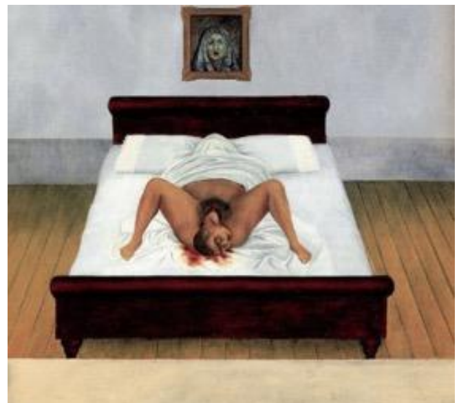
Fig. 5. Frida Kahlo, My Birth , 1932, Private Collection.

When explored further, the fundamental reasons behind both artists’ adopting the confessional mode might be boiled down to their respective need to hold onto the mode as a tool to better come to terms with the emotional or psychological damages suffered by them and resulting from past traumas. Although Emin’s work concerns more with sexual oppression [22], which is quite different from Kahlo, it is driven fundamentally by a shared desire to treat wounds inflicted by past traumas.