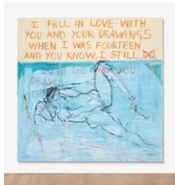
Fig. 6. Tracey Emin, Exorcism of the last painting I ever made , 1996, London.

critics and other feminist artists too. Overall, such criticism has been concentrated on the following several areas: Emin's appealing to populist sentiments, her working-class origin and subsequent reliance on commercializing her work, her anti- intellectual stance, her embracing the conservative politics, in addition to her obsession with individualism. One of the key subject matters of Emin's art has always been Margate, the little seaside town where a significant part her life's trauma took place. She came from a working-class origin, and many of her life's concerns had to do with keeping ends meet, especially after her father left her mother and her during her childhood [35]. This first-hand experience with poverty and financial insecurity from early stages of life may be behind her proactively chasing commercial success when she later started her career as an artist. A disagreeing attitude has been expressed by certain feminist critics towards her striving, often in ways that these critics tend to find fault with, for commercial success at all costs, and the reasons for this have been chiefly that such a zest for money may well translate into a ready willingness on the part of the artist to compromise the quality of her work for commercial gains. This willingness to compromise for business' sake has been linked to be behind her choosing “a particular pathologized representation of working-class femininity and sexuality, the figure of the “slag.” [36].