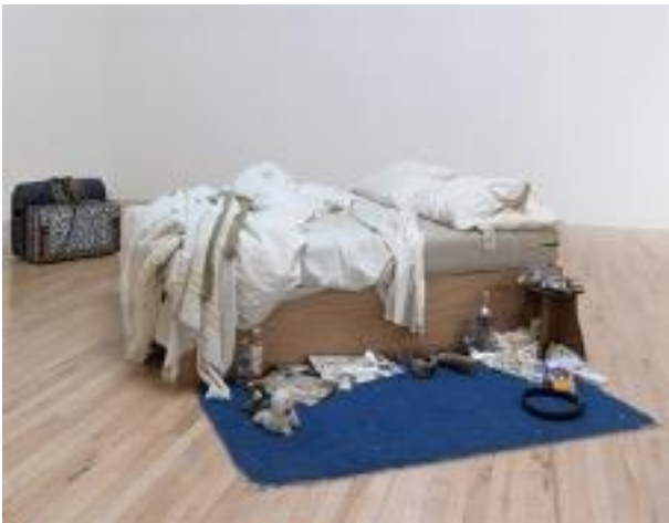
Fig. 1. Tracey Emin, My Bed , 1998, London, Charles Saatchi.

In an episode of the 2015 The Great British Bake Off , one of the female contestants decided to take a risk and present to the judges of the show a work based on one of Tracey Emin's most well-known installations. As shown in Fig. 1. The motivation behind the contestant's deciding to base her work on Emin's work remains elusive: it might be her gesture of paying tribute to an artwork by an eminent contemporary female artist whom she revered, or she may have only intended her work to be a symbolic sneer at the artist's controversial installation and was thus simply trying to comment on the work's shocking level of deskilling. In either case, the contestant's attempt was met with bitter defeat: not only was the work deemed a result of the lack of skill and motivation on the part of the contestant, but one of the show's female judges, Mary Berry, claimed that the work suffered a lack of 'tidiness' that allegedly was supposed to be a crucial element in reaping favorable first impression [4]. The fact that the 'untidiness' of the work was singled out to be the most problematic with the contestant's work betrays a deeply gendered view on the kind of proper social role the female gender should be striving to take on: namely, being orderly and tidy and respectable with what they do in life [5].