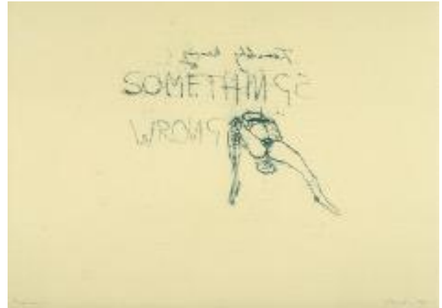
Fig. 4. Tracey Emin, Terribly Wrong , 1997, London, Tate.

unidentified substance formed between the legs of the naked body. Despite the difficulty to identify clearly what the substance is, the overall composition is highly suggestive of a woman in labor or the bloodiness of an abortion. With Kahlo’s My Birth , the female figure featured in it is also manipulated into a position that reminds the audience of the image of a woman trying to give birth.