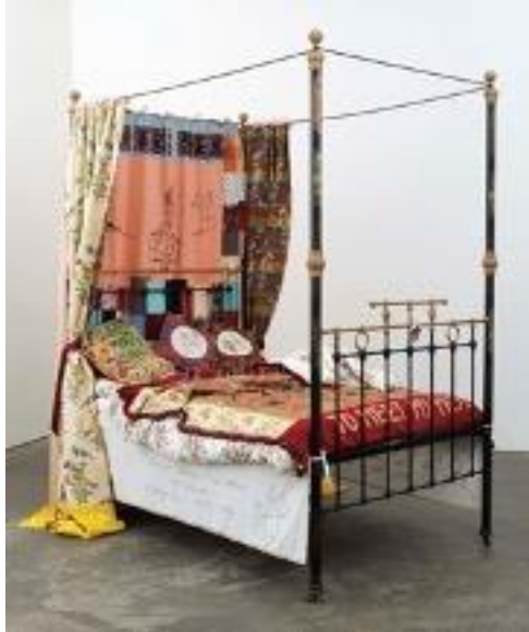
Fig. 2. Tracey Emin, To Meet My Past , 2002, London, The Saatchi Gallery.

notice the impact that the above feminist efforts to rewrite and retell art history have produced on Emin's work. Like her predecessors, Emin incorporates and has always relied upon creative media that stemmed from those efforts. She has always worked comfortably with fabric, which she tends to collect from her life. Many of her works feature the technique of embroidery, such as Everyone I Have Ever Slept With 1963–1995 (1995), which lists all the people whom she had shared her bed with from 1963 to 1995. Fig. 2 shows words and images were embroidered onto pillows and other objects to portray the fear and sexual abuse suffered by a young woman, and in Sometimes I Feel So Fucking Lost (2005) appliqués were made on hotel linens [10]. Works as such, traditionally deemed as handicrafts instead of artworks, have long been able to take on the status of being artistic techniques that reflect a unique female and feminist perspective because of feminist artists and their efforts in the past, and Emin has been arguably one of the most direct and prominent beneficiaries of this art historical development.