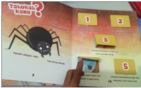
Fig. 2. Flip-flap page to support visual and kinesthetic intelligence.