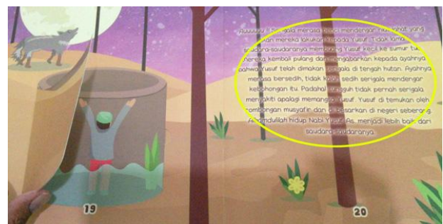
Fig. 1. Narration to support linguistic intelligence.