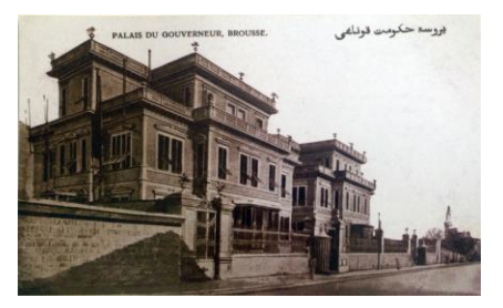
Fig. 2. Government palace [16].

The government palace and the theatre were reflecting European architecture in terms of plan and form (Fig. 2). Town hall and post-office were reflecting traditional Ottoman fabric in terms of construction methods and material. Saint Laurent determined the location of government palace as the public square on which the statue of Atat ürk is located now. Three-storey masonry building was constructed with brick, stone and stucco and had a rectangular plan. It had a simple facade with minimal ornamentation. There were the rooms for the judge on the ground and first floors and governorship on the second floor [15].