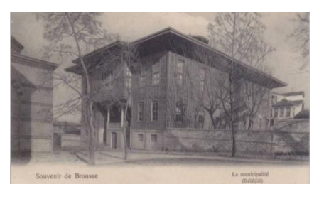
Fig. 3. Town hall [16].

After the first municipality established in Istanbul in 1854, in 1866, it was determined that all municipal works should be disseminated all over Anatolia. In Bursa a municipality was organized in 1867 in order to realize modern urban activities. [13]. Town hall was located in the vicinity of government palace. (See Fig. 3) Post-office and theatre were also located in that same region [12].