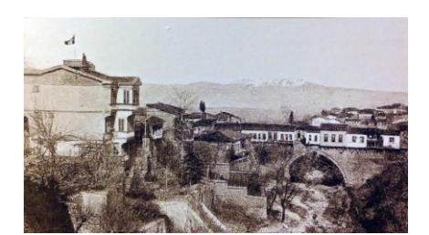
Fig. 5. French consulate [16].