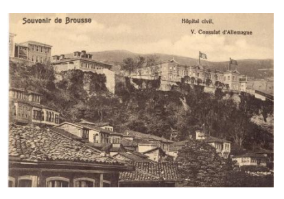
Fig. 9. Gureba hospital [16].

After the 1855 earthquake that caused great damage, the first Ottoman hospital, which was opened in 1390s, couldn't provide service properly due to the incressing amount of patients and injured people. Ahmet Vefik Pasha, when appointed to Bursa, aimed to establish a modern hospital in order to solve the health service problem. He selected the first settlement place in Bursa for the location of the hospital (Fig. 9). This region is known as Hisar (named after the citadel) located on a high topography, dominating the town.