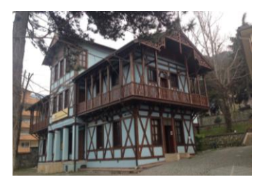
Fig. 15. The school of sericulture.

Education was one of the fields that foreigners made investments with the rights they attained in Ottoman Empire. Among the schools that foreigners established in Bursa was The School of Sericulture opened by French capital in 1888. The aim of the school was to provide training in sericulture and support the local silkworm production. In 1894, it moved to a building reflecting aesthetic approach of Westernization period (Fig. 15). This school was located in Setbasi district where Armenian and French population were dense. The architecture of the school was similar with French schools and residences at that time depending on the relations started with France on raw silk trade [5].