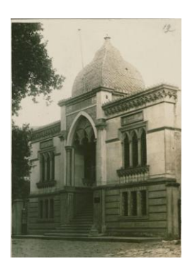
Fig. 4. Ottoman bank [17].

The necessity of a financial institution emerged depending on industrialization, the establishment of factories, and new financial relations. Ottoman Bank, which was founded in Galata, Istanbul in 1856, opened its first branch in 1875 in Silk Khan, located inside Bursa Historical Bazaar and Khans Region. This condition displayed the impact of new financial relations on site selection of the financial institution [12]. The branch changed its location 20 years later (see Fig. 4) [7].