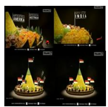
Fig. 1. Food import practices.

message on the rice cone. It describes the most Indonesia citizen's basic needs for food. The cone refers to the shape of mountain, which became the ancestor worship place where believed as the dwelling place of the Creator's spirit. Therefore, the yellow color represents prosperity. This ad implies that PDI-P has the party program to achieve food self-sufficiency. The program goal is to achieve food sovereignty in order to create well-being.