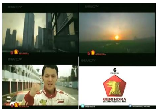
Fig. 5. Representation of gerindra party.

corruption, strong governance, and education quality. All the agenda could be reached out by people themselves. The power of change is the keyword for bringing up Indonesia.