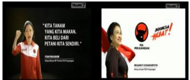
Fig. 2. Puan Maharani and Megawati Soekarno Putri.

Another meaning of this ads represents PDIP party deterrmination which is confirmed by Puan Maharani, Chief Executive of PDIP who states that "Kita tanam yang kita makan, kita beli dari petani kita sendiri". Hands Clenched with a firm voice message symbolizes the determination of the party to embody the slogan "Indonesia Hebat" for Indonesia (see Fig. 2).