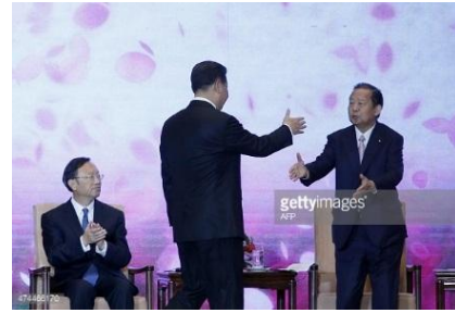
Chinese President Xi Jinping (C) shakes hands with the chairman of Japan's Liberal Democratic Party's General Council Toshihiro Nikai (R) as Chinese State Councilor Yang Jiechi looks on during the China-Japan friendship exchange meeting in Beijing, May 23, 2015.