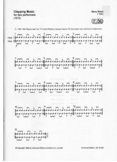
Fig. 2. Steve Reich's clapping music: For two performers [13].