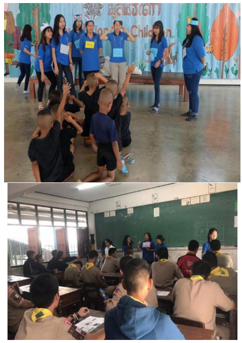
Fig. 1. The promotion reading project base learning for early childhood The reading habit and learning culture questionnaire are

The activities of promotion reading project base learning are shown in Fig. 1-2.