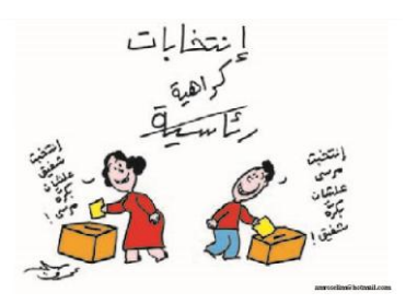
Fig 4. Hater (Presidential) Elections! ( Al-Shorouk , 22 June 2012, reprinted with the cartoonist's permission).

Finally, more than 51 percent of eligible voters (about 26 out of 51 million) voted in the second round, while Invalidated votes (voiders) numbered more than 800,000. Muslim Brotherhood candidate, Mohamed Morsi, emerged as the first democratically elected president of Egypt and the country's first Islamist president, winning 51.7 percent of the votes with a narrow margin over Shafiq [43].