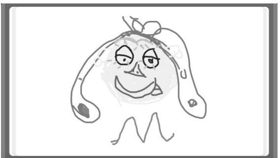
Fig. 3. Example of final product of letter m (mum) using My Story.