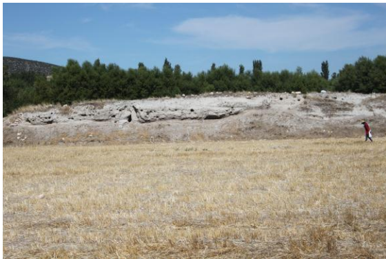
Fig. 3. Harmanyeri Mound, Dinar, destruction.