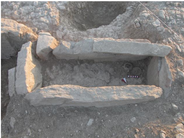
Fig. 2. Dede Mezar excavation 2005, Trench A cist grave and small findings.