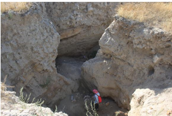
Fig. 4. Gebeceler Sankaya Mound, destruction.