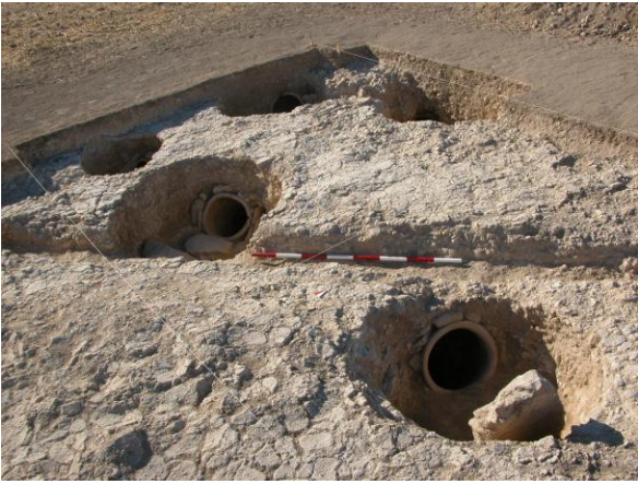
Fig. 1. Dede Mezar excavation 2007, G2 (right), G4 (middle), G5 (left) graves