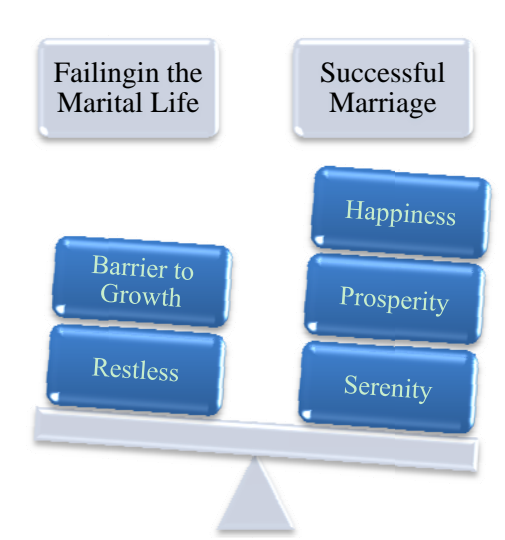
Fig. 1. Signs of successful and failed marriage.

psychologists define it as: "satisfaction from the existing conditions." A philosopher once said: "you live as you think."